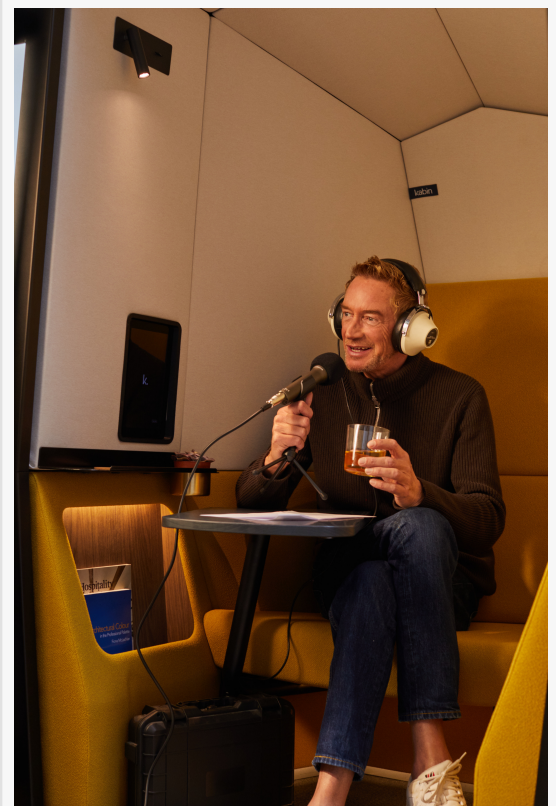
Kabin can be used for calls, meetings, work, podcasting and more.

Visitors to San Francisco Design Week can step inside Kabin's latest iteration and explore updates that reflect a deepened understanding of how people use protected time and space. The updated OS now includes new language options, expanded visual environments, and refined soundscapes. An interactive timer offers four behavior-based session modes — Deep Focus, Personal Recharge, Quick Sprint, and Connection (Kabin 2 only) — inviting users to set an intention before they enter, not just a clock. A newly integrated occupancy light signals availability without interruption. Kabin 2 also debuts a reworked guest seat and a second