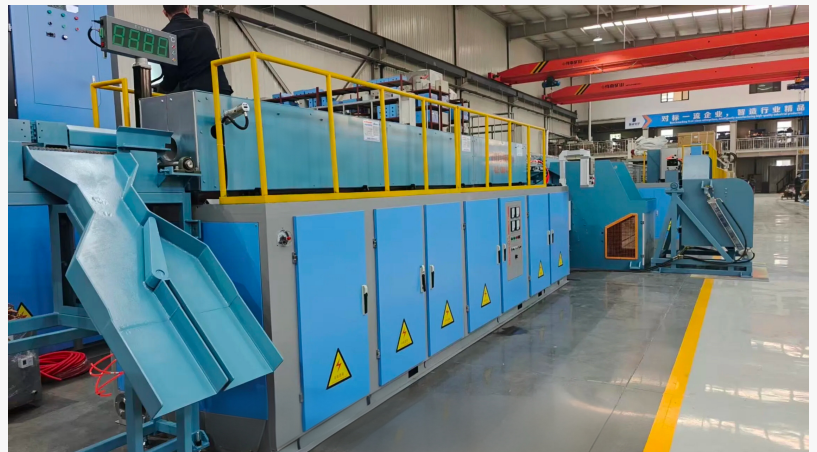
steel-copper-Titanium-Aluminum billet heating furnace with induction