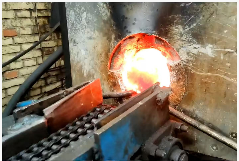
steel billet induction heating furnace-billet heating furnace with induction-copper billet heating system

Inductotherm Group remains one of the most recognized names in the global induction heating and thermal processing industry. Its global platform covers melting, heating, heat treating, forging, rolling, cutting and welding technologies. Public company information describes Inductotherm Group as a leader in thermal processing technologies with more than 70 years of engineering development, 10 global brands and a broad product portfolio for metal transformation. For billet heating furnace buyers, Inductotherm is highly relevant because of its specialized induction forging and billet heating products. The company's Inductoforge® induction billet heating systems are positioned specifically for modern forge shops needing fast, uniform and efficient billet heating before forging. Inductotherm's key advantage is its global engineering and service structure. Large forging groups, multinational manufacturers and metal processing companies often consider Inductotherm when they need proven industrial equipment, international support and established induction heating technology. Its scale, brand recognition and long history make it a natural leader in this investigation.