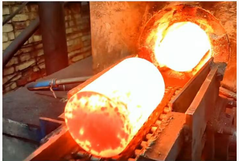
steel billet induction heating furnace-billet heating furnace with induction

Induction billet heating works by passing billets through one or more induction coils. High-