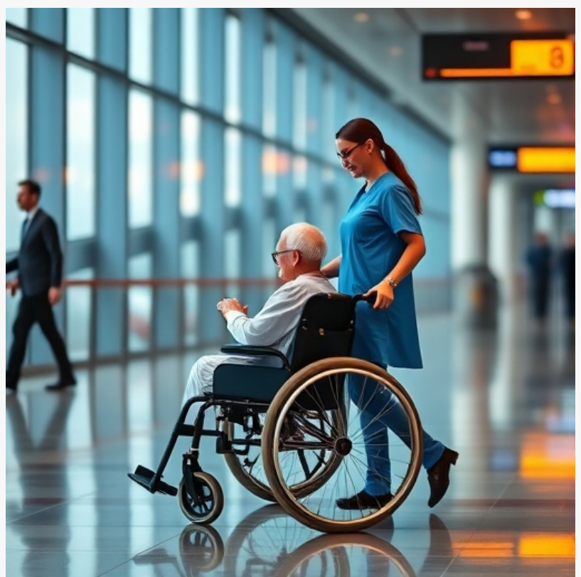
Medical Escorts with Patient

"The biggest misconception families have is that air ambulance is the only safe option for bringing someone home," said Major (Ret.) Marc Brinsley, RN, BSN, MSN, founder of RN MEDFLIGHTS and retired U.S. Army nurse. "For a stable patient, our licensed RN provides the same nursing care — monitoring, medications, emergency response — without the six-figure price tag. We exist because families deserve to know this option is available before they sign an air ambulance contract in a foreign country."