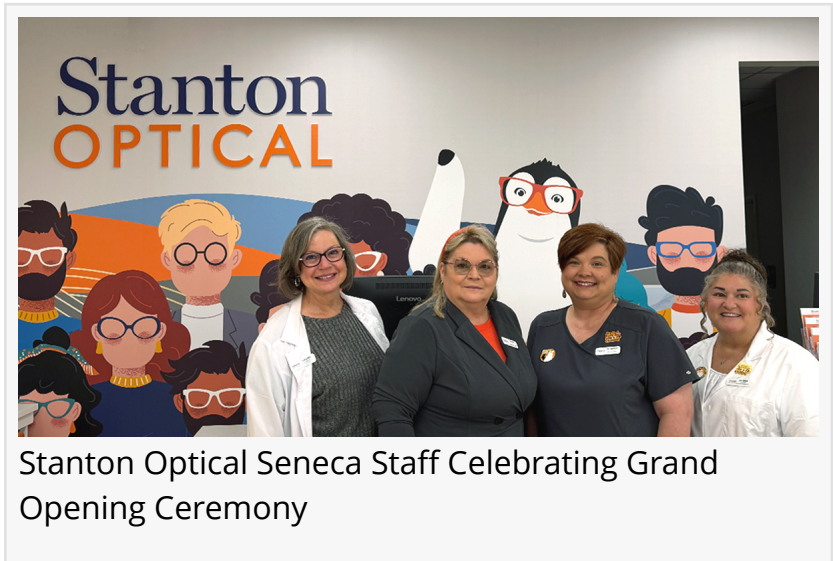
Stanton Optical Seneca Staff Celebrating Grand Opening Ceremony

SENECA, SC, UNITED STATES, June 10, 2026 /EINPresswire.com/ -- (June 8, 2026) – Stanton Optical, a leading provider of affordable and accessible eye care, is proud to announce the grand opening of its newest location at 1026 Bypass. This is Stanton Optical's 15th location in South Carolina, reinforcing its commitment to Making Eye Care Easy across more than 300 stores nationwide .