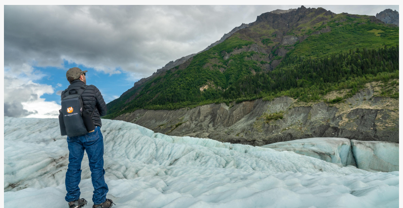
Off the Beaten Path Group Traveler Taking in the Views at Root Glacier

BOZEMAN, MT, UNITED STATES, June 9, 2026 /EINPresswire.com/ -- Off the Beaten Path , a leader in immersive, experience-driven travel, has announced the launch of its newest and most ambitious itinerary to date: the Alaska National Park Grand Slam Small Group Adventure , the first fully guided, small group journey to all eight of Alaska's national parks.