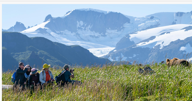
Bear Viewing in Katmai National Park