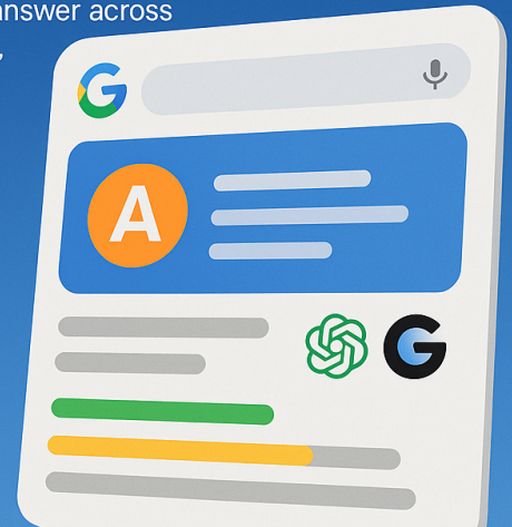
Generative Engine Optimization

We redefine digital marketing for the AI era. Ensure your brand isn't just found, but becomes the trusted answer across Google's AI Overviews, ChatGPT, and Gemini.