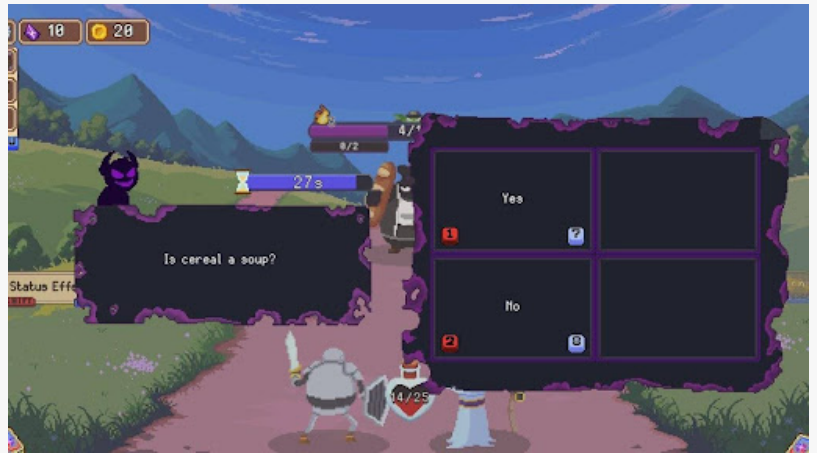
Duo Quest Gameplay