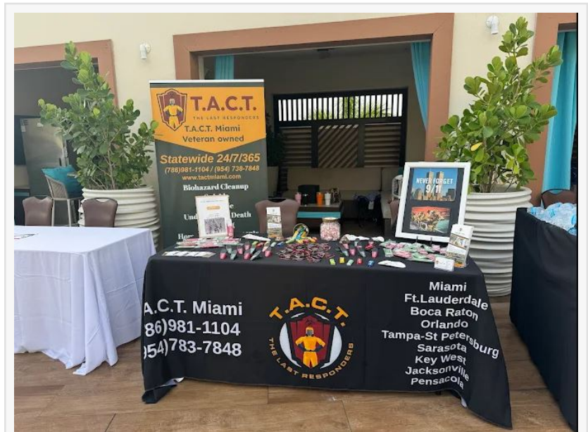
TACT Miami is a professional biohazard remediation and trauma cleanup service