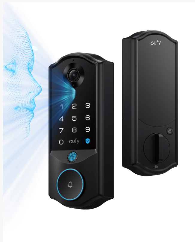
eufy FamiLock E40_Product image 1