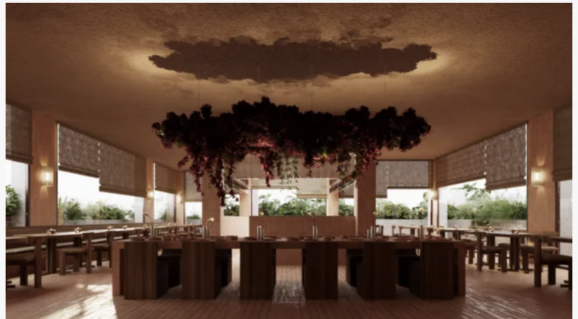
Wake aims to offer a new kind of luxury experience in Medellín, with wellness and attention to detail at its core.