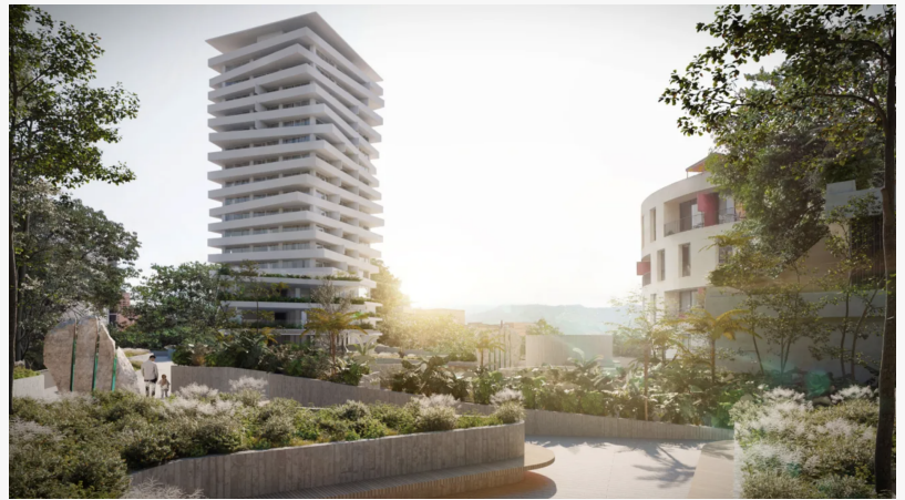
Wake Medellín, a new luxury wellness destination in Medellín, Colombia.