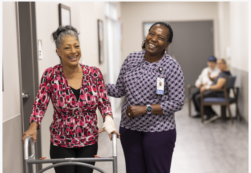
PACE participant and Registered Nurse, at Ascension Living HOPE, Kansas