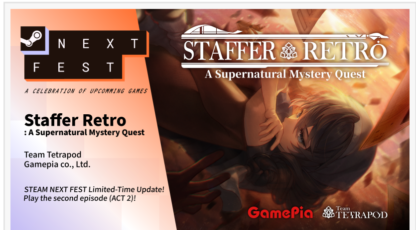
Staffer Retro Next Fest

The fourth title in the series, Staffer Retro, follows Verita Retro, a young girl burdened by an enormous debt who becomes entangled in a mystery that leads her to uncover the hidden side of a world shaped by supernatural powers. The game features over 30 hours of gameplay, Spine-animated character presentation, and a deduction system built around more than 100 clues.