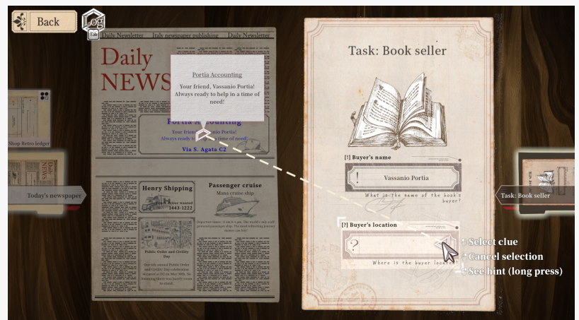
Staffer Retro Screenshot 1