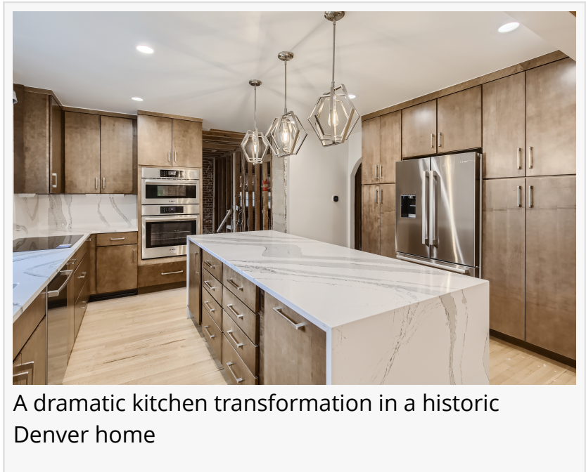
A dramatic kitchen transformation in a historic Denver home

The design centers on a quartzite slab backsplash that runs wall to wall, paired with custom walnut-stained cabinetry, a large waterfall island, and an induction cooktop set flush into the surface. The result is a statement kitchen built to carry the home for decades, planned and specified in full before demolition began.