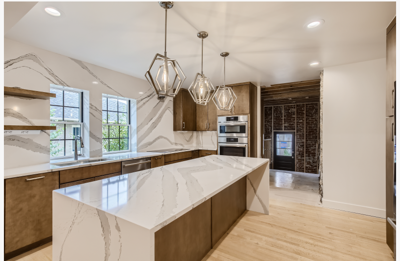
Denver Kitchen Project