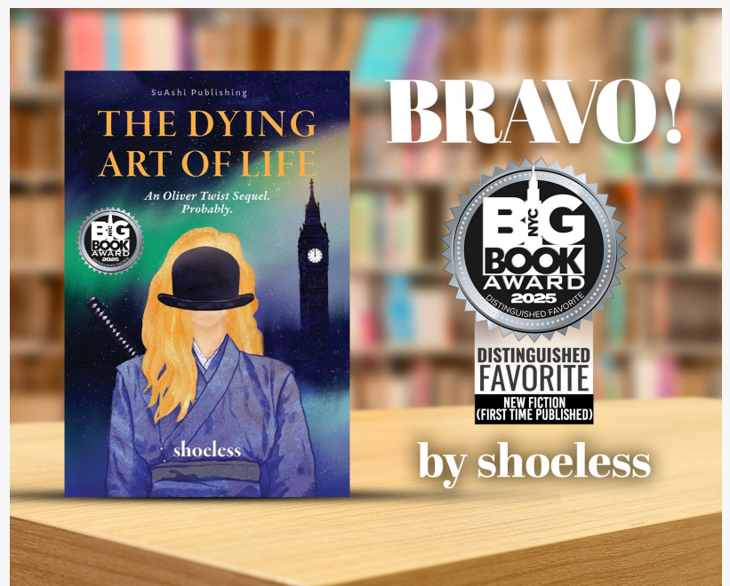
NYC Big Book Award Distinguished Favorite