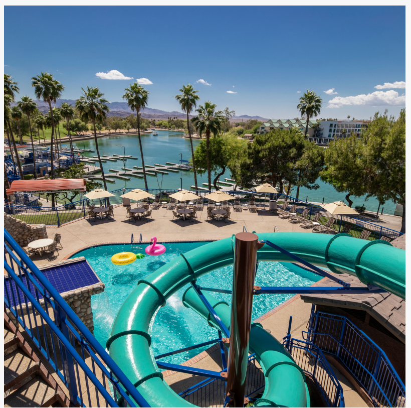
Waterslide at upper pool

This press release can be viewed online at: https://www.einpresswire.com/article/918763343