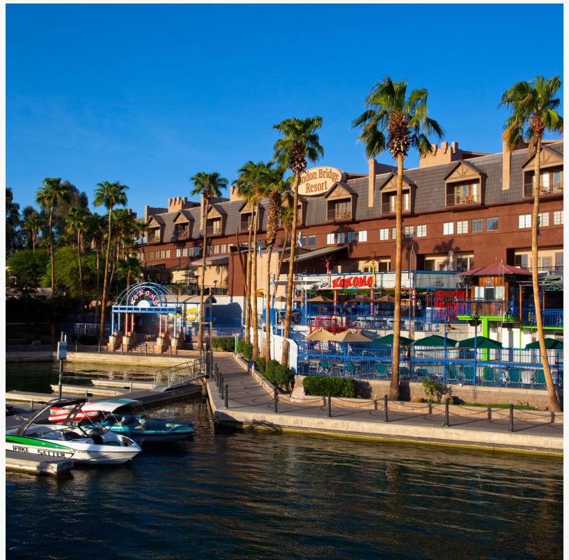
View of London Bridge Resort from the docks

Available through October 2026, the seasonal offerings provide additional incentives for visitors to experience the destination outside of traditional weekend travel patterns while supporting tourism activity throughout the summer season.