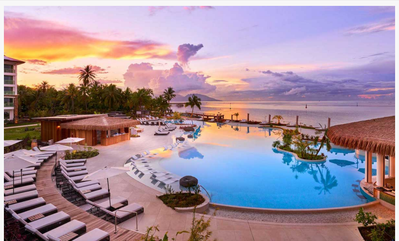
Hilton Hotel Tahiti

LUXEMBOURG, LUXEMBOURG, June 12, 2026 /EINPresswire.com/ -- Green Globe certification has been awarded to Hilton Hotel Tahiti , located in Papeete, the capital of French Polynesia. For sophisticated travelers, the very best of Tahitian elegance is celebrated here with stunning ocean views that bring the natural beauty of Moorea Island and the Pacific Ocean to every corner.