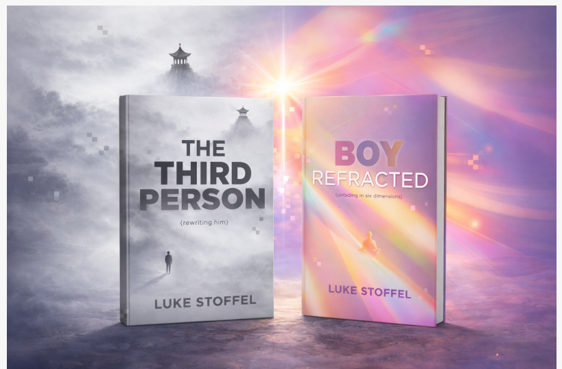
The Warboy Chronicles