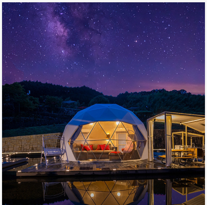
luxury geodesic dome

Safari tents are often well-suited for areas requiring minimal site disturbance, while dome structures can be positioned to take advantage of panoramic views and more exposed environments. The ability to deploy different accommodation types across varied terrain allows developers to optimize land use and enhance the overall guest experience.