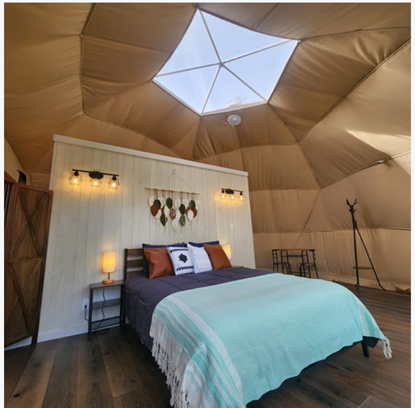
7m Stargazer Geodesic Dome