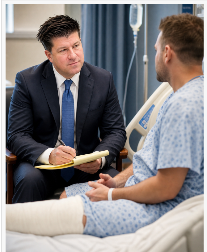
Attorney DeSalvo visiting a client

Negligent security claims arise under Illinois premises liability law in two ways: when a property owner fails to take reasonable steps to protect visitors from foreseeable criminal acts, and when security personnel themselves — guards, bouncers, or loss prevention officers — injure the people they are supposed to protect. In the second category, Illinois law can hold the business, the property owner, and the security company accountable for excessive force and for negligent hiring, training, or supervision of guards.