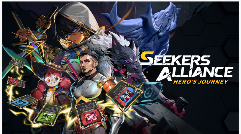
Seekers Alliance: Hero's Journey

Entertainment today released a major new demo update for Seekers Alliance: Hero's Journey as part of Steam Next Fest , running from June 15–22. The update introduces powerful new Hero Signature Abilities, expands the game's story content with Hero-specific events, adds new Achievements, and challenges players to unlock a brand-new Hero: Lil' Gecko, S.W.T.