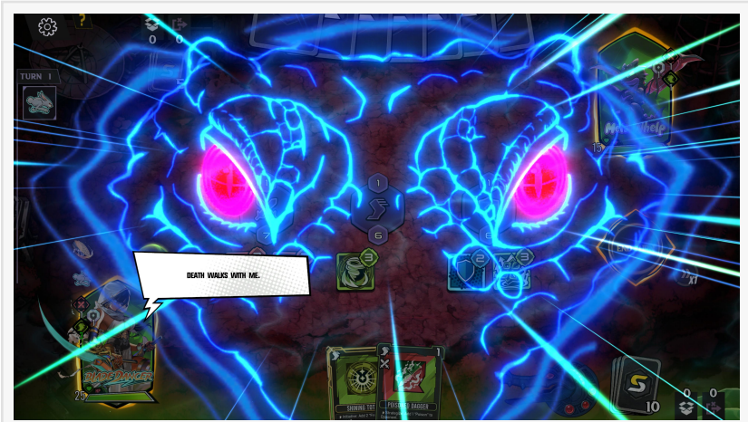
Blade Dancer's Signature Ability

Arondight gains Charge at the start of every turn and whenever Shimazu loses a Zone. Even while falling behind, Shimazu continues building momentum for a devastating counterattack. Once fully charged, Arondight can be unleashed manually. During this state, Shimazu projects his inner world onto the battlefield. Victories in any Zone deal damage equal to the Energy difference between the players, allowing him to attack up to three times in a single turn. However, the power comes at a cost. If Shimazu fails to defeat his opponent before the turn ends, all bonus damage inflicted by Arondight rebounds back onto Shimazu.