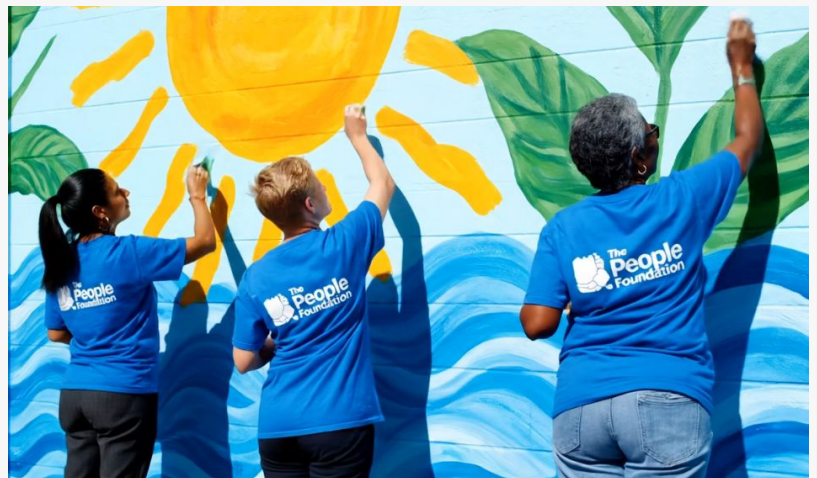
Community volunteers participate in a collaborative service project supported by The People Foundation.