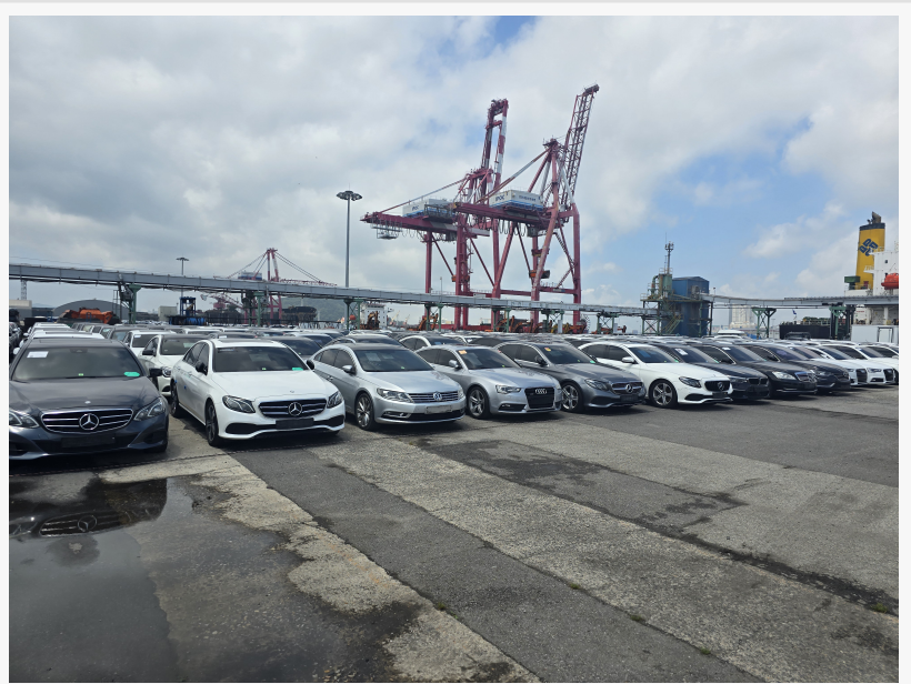
Korean used car in the port