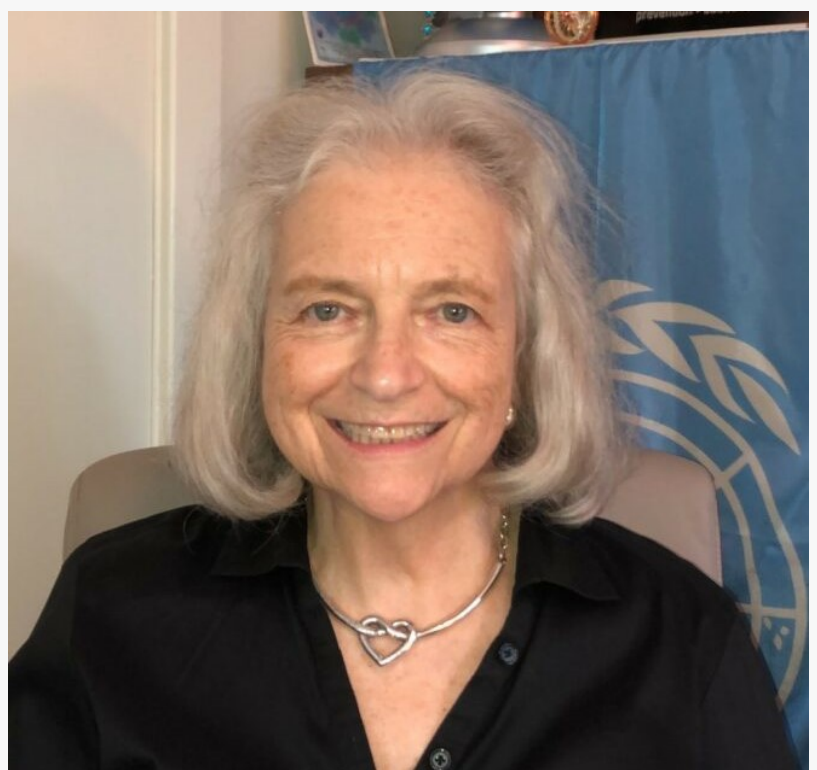
Representing The Peace Alliance, and the Global Alliance for Ministries and Infrastructures for Peace.

“Peace is not only a hope or a slogan. It is a living practice, a civic responsibility, and a future we can intentionally design, build, and sustain. As this final week begins, we are calling people everywhere to take one more step — and then another — toward healing, belonging, collaboration, and peace.”