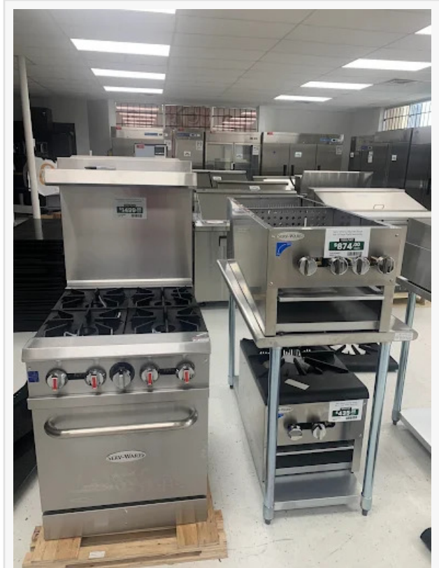
Modern HorecaStore showroom showcasing high-quality stainless steel commercial kitchen equipment, including gas ranges and ovens, designed for professional foodservice operations.

Visit: https://www.thehorecastore.com/tableware