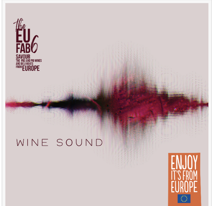
Cover Wine Sound

In parallel with the music production, a 25-minute short film was created to visually narrate the same production phases. The highly evocative images interact with the tracks in an immersive