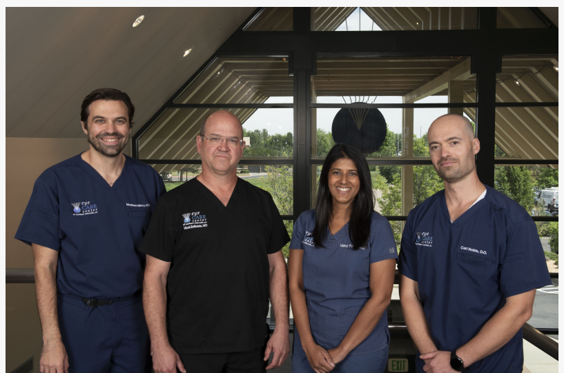
Loveland Care Team

LOVELAND, CO, UNITED STATES, June 15, 2026 /EINPresswire.com/ -- Eye Care Center of Northern Colorado , a leading physician-owned ophthalmology practice, has announced the opening of its newest office in Loveland, Colorado . Scheduled to open this July, the new facility is located at 5250 Hahns Peak Drive, Suite 180, and aims to expand access to comprehensive medical and surgical eye care services for residents in the region.