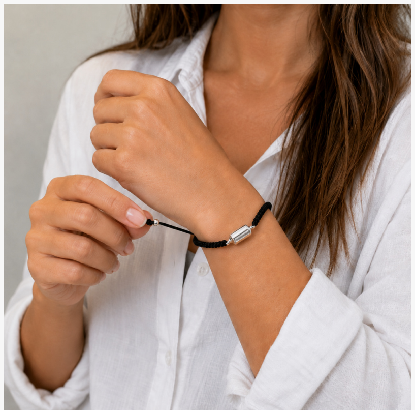
Forever Collection - Cremation Bracelet

/EINPresswire.com/ -- The Living Urn, a division Biolife, LLC, is excited to introduce the Forever Collection. This unique jewelry line includes the Forever Bracelet, a premium cord cremation bracelet that comes with either a heart, cross, or cylinder charm that holds ashes, and the Forever Cross Pendant that is offered in either gold, silver, or black and holds a small portion of a loved one's ashes. The company expects to expand this premium collection over the coming months with a multi-color steel bar pendant and other unique high-quality options.