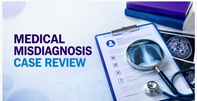
medical misdiagnosis case review.