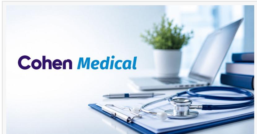
Cohen Medical Consulting.

The consulting work is centered on the interpretation of medical information rather than direct clinical care. The objective is to organize medical details in a clear format for reference by both patients and legal professionals involved in case evaluation.