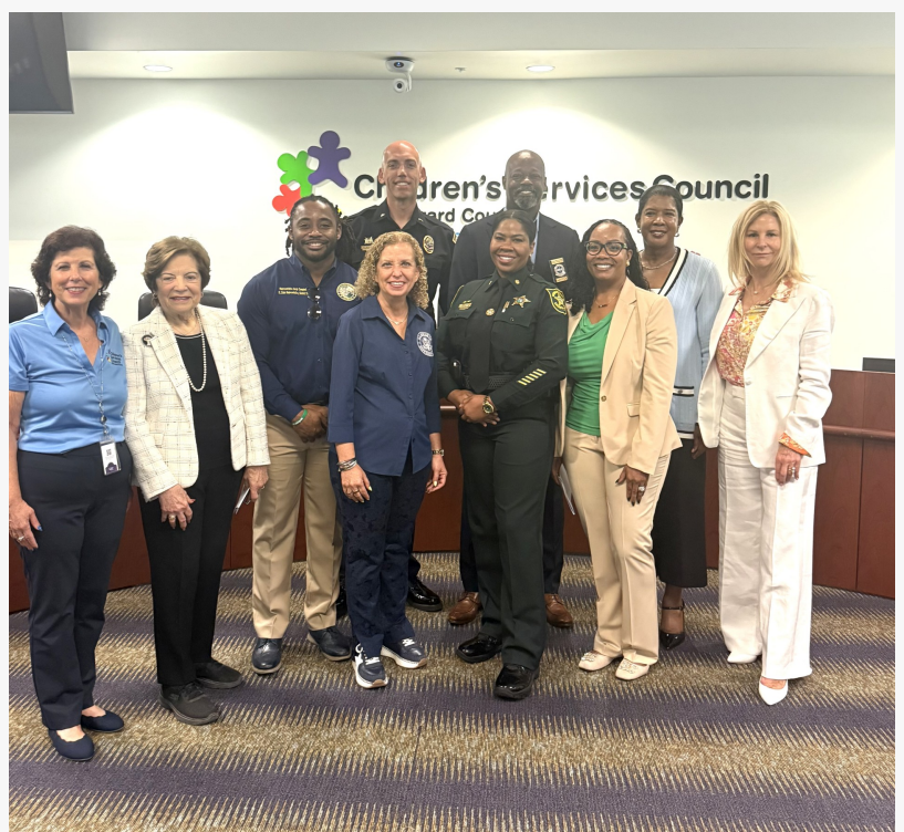
A coalition of Nonprofits, Law Enforcement Agencies and Elected Officials gathered at a press conference to outline a coordinated effort to place the free child identification kits directly into the hands of parents and caregivers across the region

The launch comes as Florida continues to rank among the states reporting the highest number