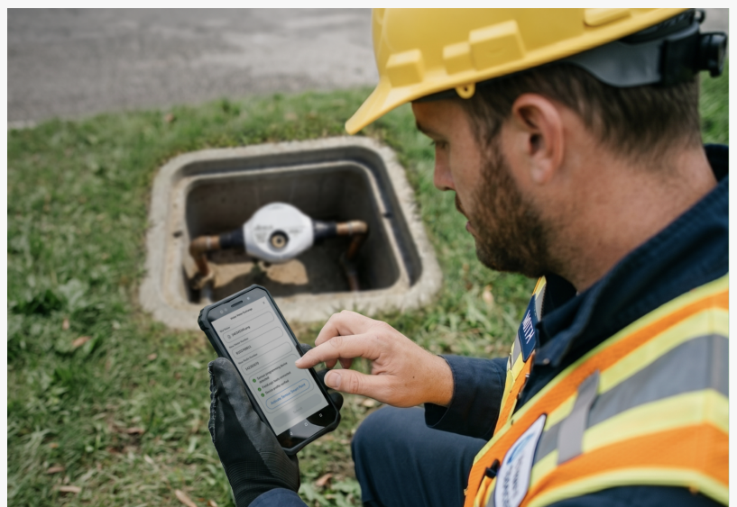
Tech installing Sensus meter with Fieldman app

This press release can be viewed online at: https://www.einpresswire.com/article/920020960