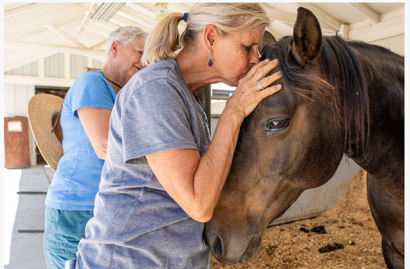
In person workshops