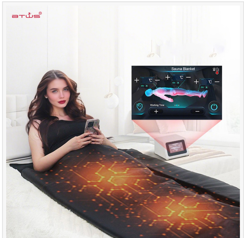
BW-804 LCD Touch Screen Sauna Blanket

To support its export-oriented business model, BTWS products are certified under multiple international standards. The company is recognized as a National High-tech Enterprise in China (Certificate No. GR202444012114). Its products hold certifications including CE, FCC, UKCA, RoHS, and 3C, ensuring compliance with the regulatory frameworks of major global markets.