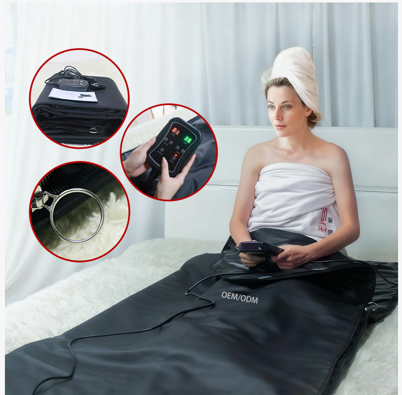
3 Zones Button Infrared Sauna Blanket Velcro Type (BW-803)