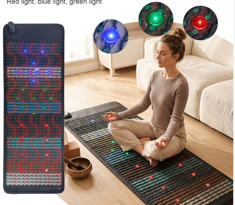
BW-501 Amethyst Mattress with Red Lights