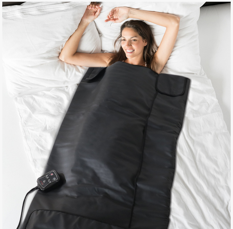
LCD Touch Screen 3 Zones Velcro Type (BW-804)