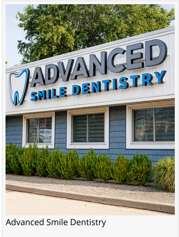
Advanced Smile Dentistry

Dental implants are titanium posts surgically placed into the jawbone to support replacement teeth. Depending on the patient's needs, implants may support a single crown, multiple teeth, implant-supported dentures, or a full-mouth dental implant restoration .