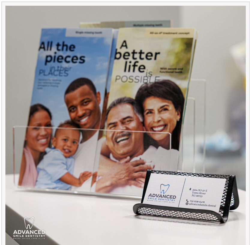
A better life is possible with Advance Smile Dentistry

Dentures may be appropriate for individuals seeking a non-surgical and lower-cost tooth