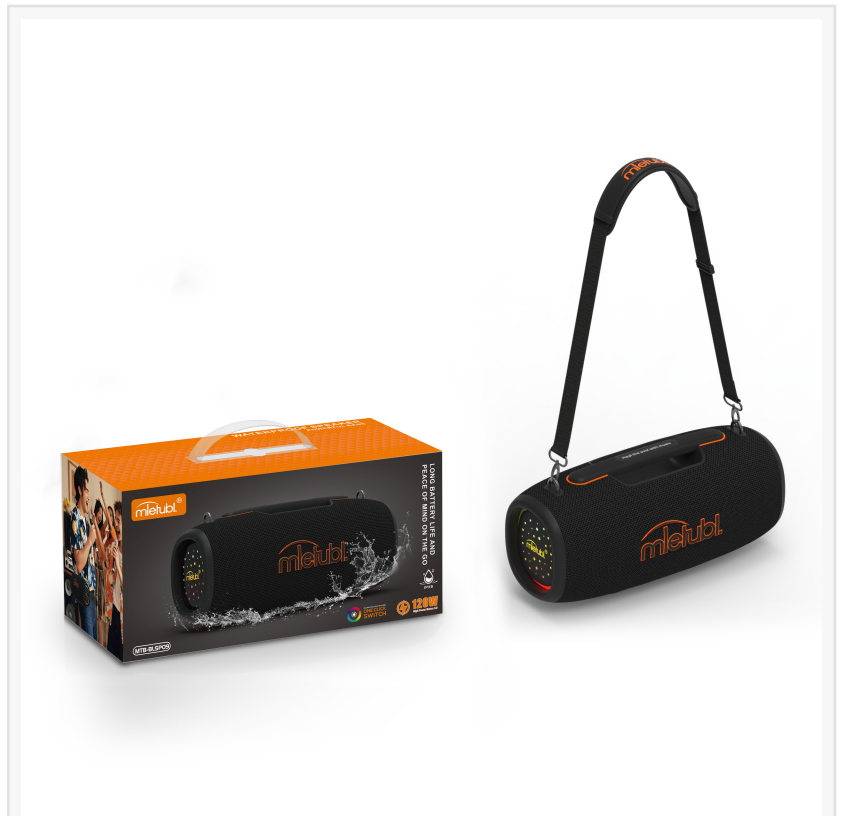
Waterproof Outdoor Speaker MTB-BLSP09

The cornerstone of MIETUBL's device protection segment is its Intelligent Screen Protector Cutting System. This system represents a shift from traditional retail models by offering on-demand customization. By combining proprietary software, a cloud-based database of device dimensions, precision cutting hardware, and advanced hydrogel film materials, the system allows retailers to cut custom screen