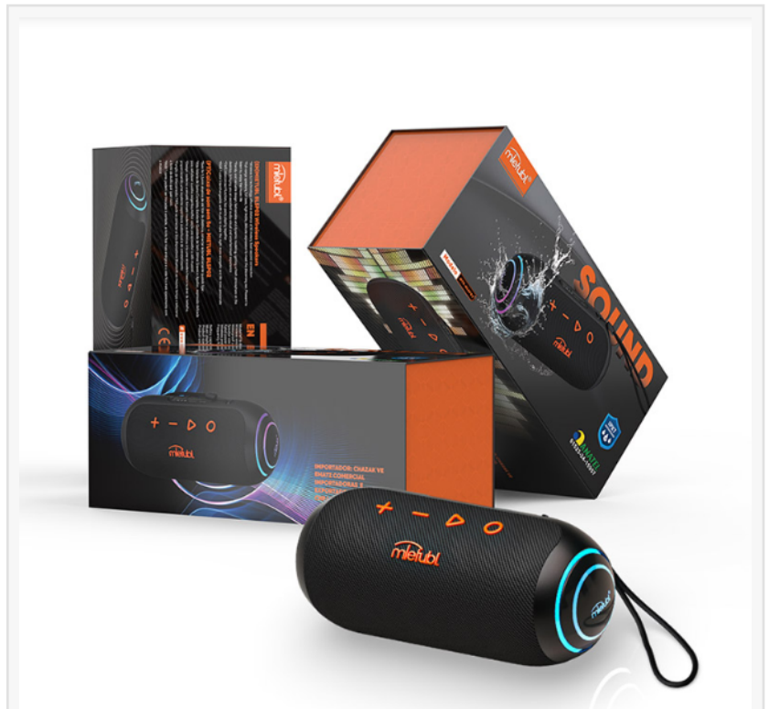
Water resistant bluetooth speaker

The speaker is powered by a high-capacity 20,800mAh battery array (composed of eight 2,600mAh cells), which supports 6 to 8 hours of continuous music playback. Beyond audio reproduction, the MTB-BLSP09 serves as a high-speed power source for mobile devices. It incorporates PD2.0 and QC2.0 fast-charging protocols, supporting input and output configurations of 5V, 9V, 12V, 15V, and 20V with a maximum power delivery of 60W. Housed in a robust enclosure measuring 396170193mm, the speaker carries an IPX6 water-resistance rating, protecting it against high-pressure water