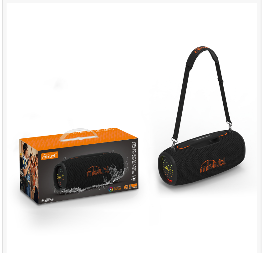
Waterproof Outdoor Speaker MTB-BLSP10