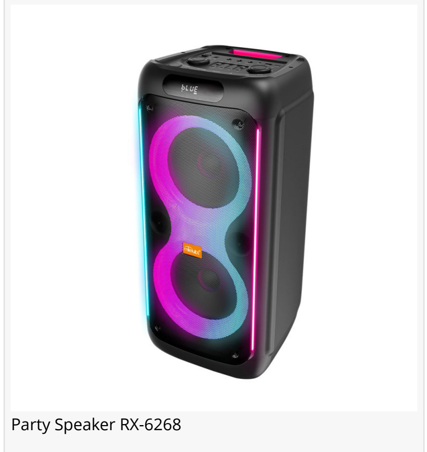
Party Speaker RX-6268