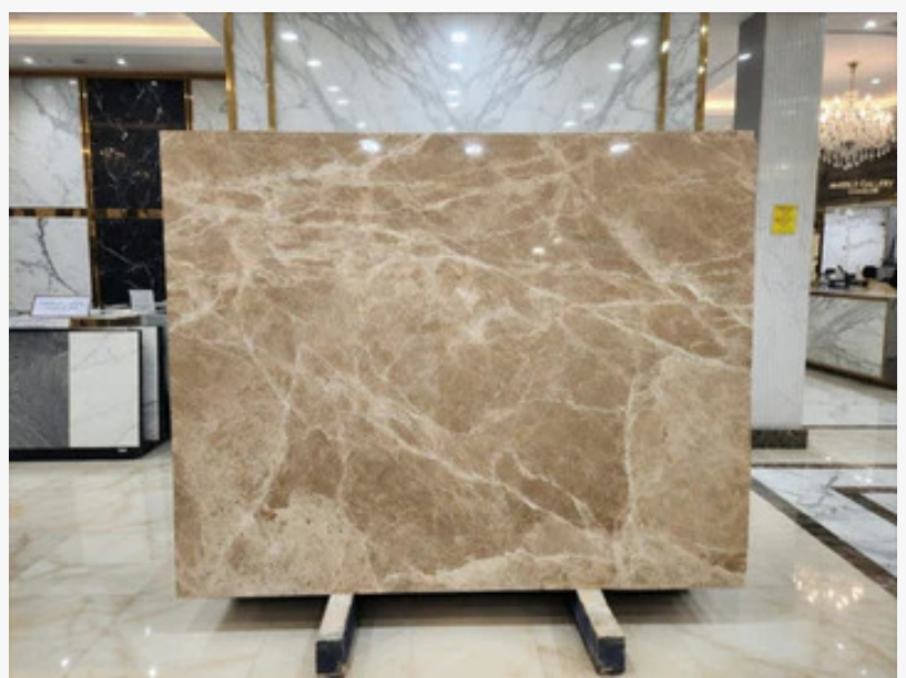
Beige Italian Marble Mumbai

When the need increases, many homeowners approach a White Marble Supplier in Mumbai to