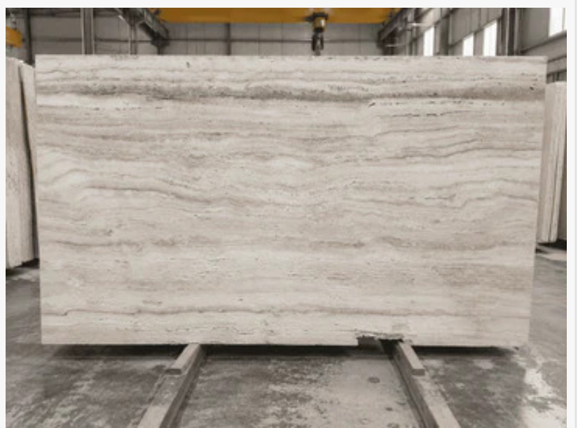
Premium Travertine Marble Supplier in Mumbai

Designers are seeing a growing interest in beige and neutral-toned stone materials that create a softer visual presence but still deliver a quality style. These materials are frequently seen in environments that strive to strike a balance between contemporary design and friendly ambiance.