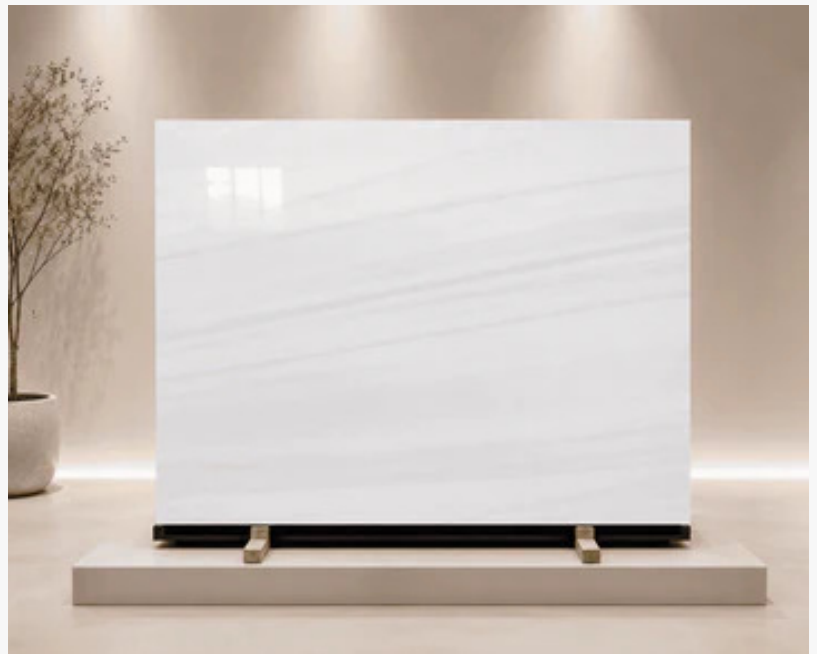
Italian White Marble