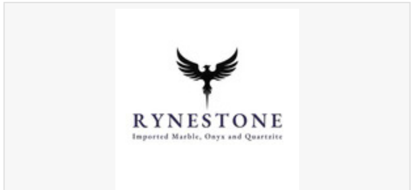
Rynestone - Mumbai

Experts claim that marble is still one of the most sought-after natural stones because of its unique beauty, range of finishes, and the ability to work with many architectural styles.