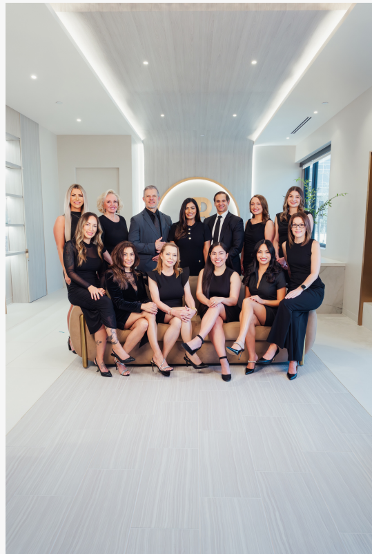
Body by Ravi Plastic Surgery & Aesthetics team