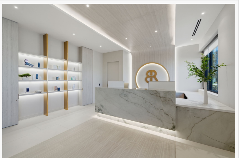
Body by Ravi Plastic Surgery & Aesthetics interior