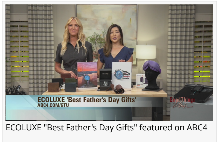
ECOLUXE "Best Father's Day Gifts" featured on ABC4