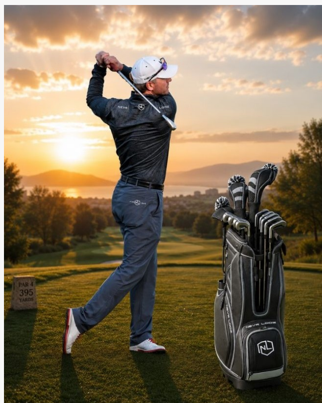
NEVR LOOZ C2-Utility Golf Bag