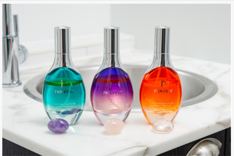
Novéra Skincare Gemstone Infusion collection

Emanuel New York is a Midtown Manhattan luxury boutique located at 329 West 39th Street, offering a curated mix of niche fragrance, beauty, skincare, clothing and accessories. Positioned