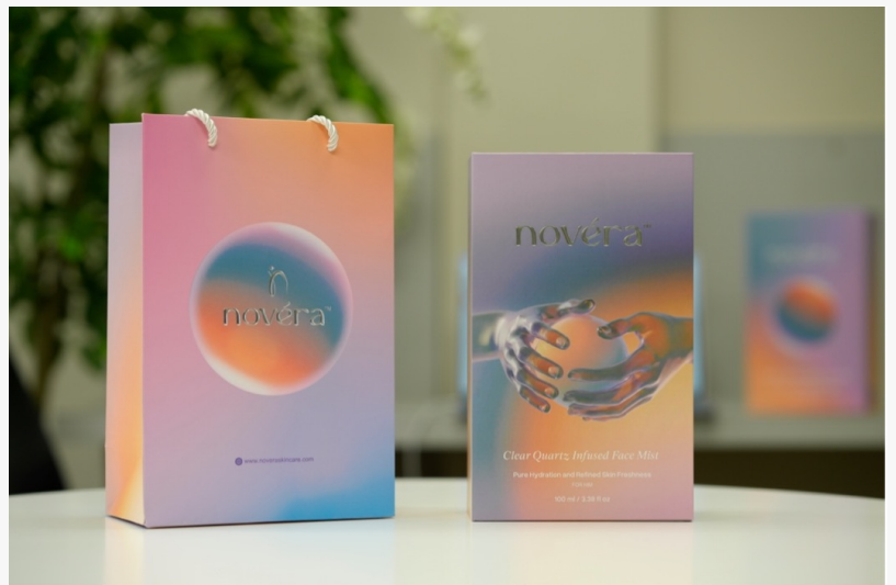
Novéra Skincare Gemstone Infusion collection