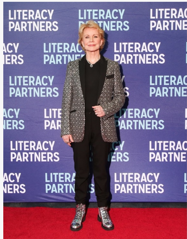
Patricia Cornwell