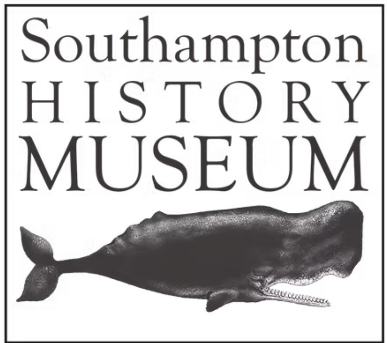
Southampton History Museum Logo