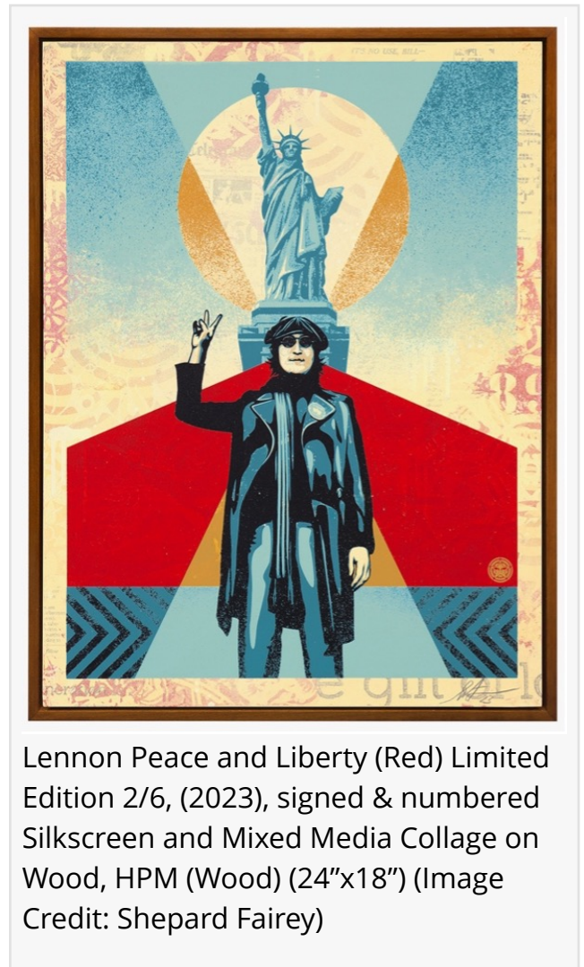
Lennon Peace and Liberty (Red) Limited Edition 2/6, (2023), signed & numbered Silkscreen and Mixed Media Collage on Wood, HPM (Wood) (24"x18") (Image Credit: Shepard Fairey)