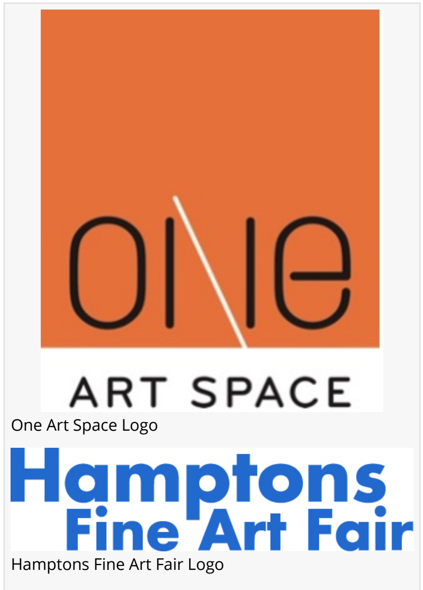
One Art Space Logo

At Hamptons Fine Art Fair, One Art Space will showcase signed and numbered Fairey works that reflect the artist's enduring focus on peace, liberty, dignity and social consciousness. Among the featured pieces is "Lennon Peace and Liberty (Red) 2/6," 2023, a limited-edition, signed and