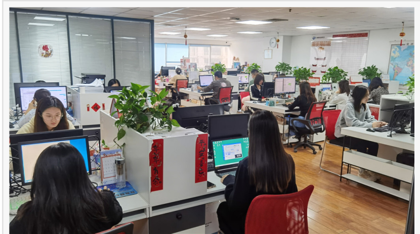
Speed Logistics Office Environment

Established in 2011, Speed International Logistics Co., Ltd. has built over 15 years of industry expertise in freight forwarding and