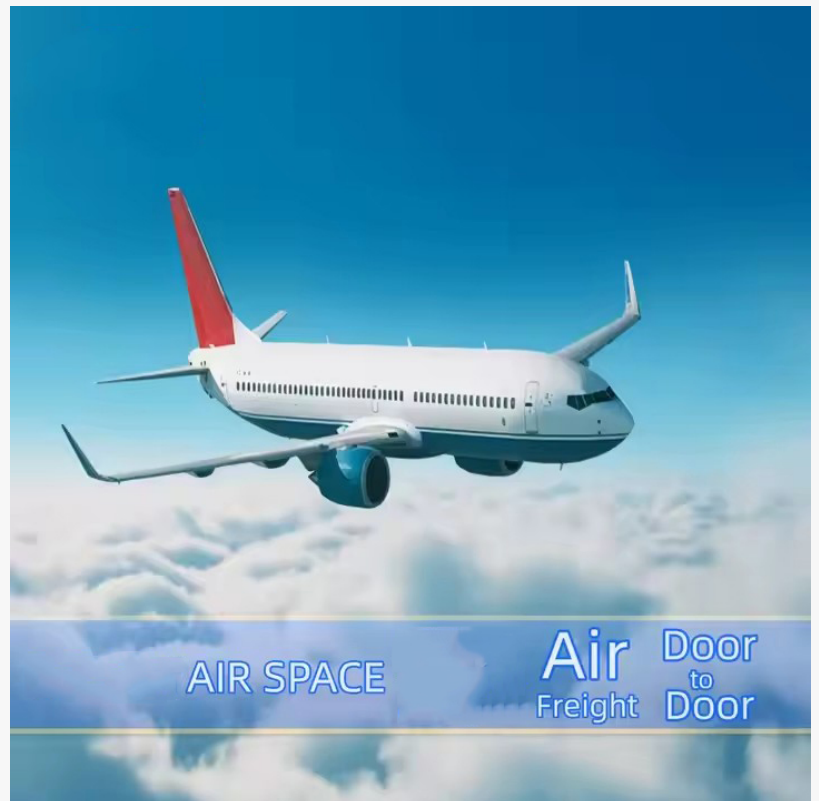
International Air Freight Services