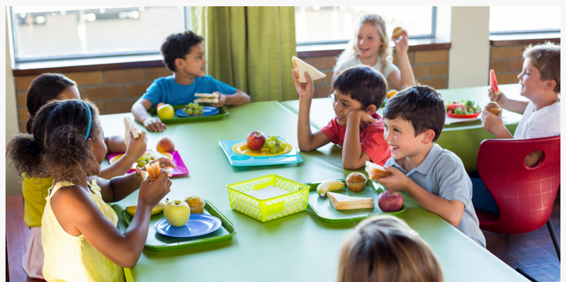
daycare near Sauganash Chicago_