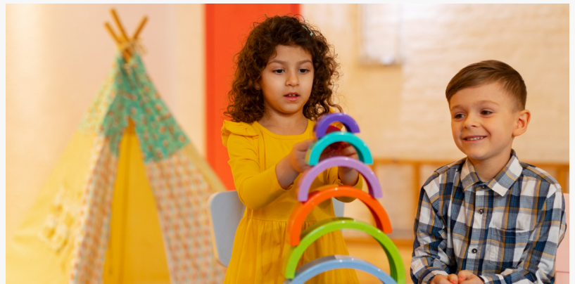
daycare Norwood Park Chicago_