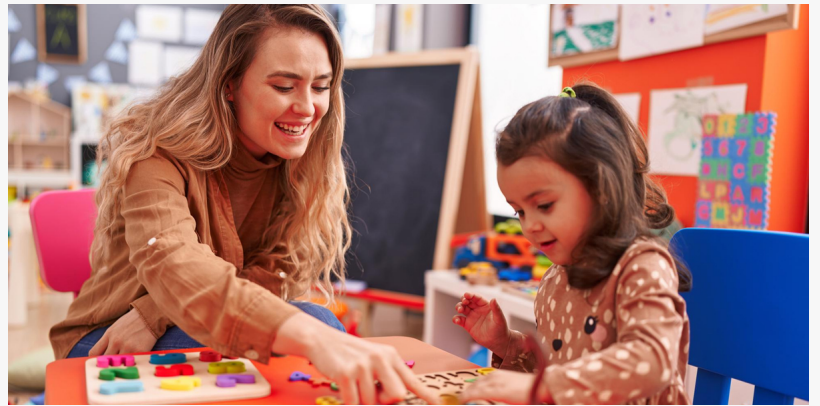
daycare Jefferson Park Chicago_