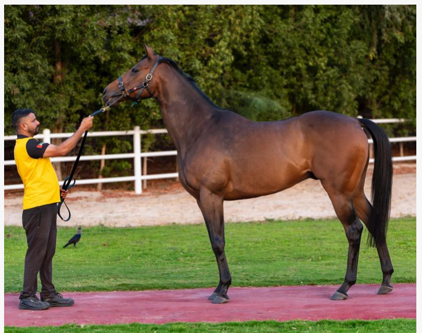
Asaassi - New to RaceX