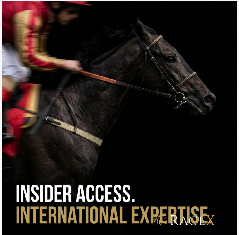
RaceX Racehorse Syndication - International Experience