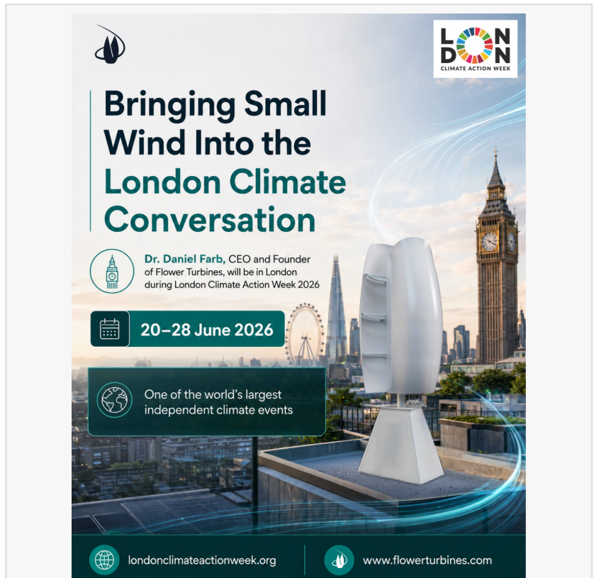
Flower Turbines at London Climate Week

The company intends to supply the UK with a missing link in the renewables