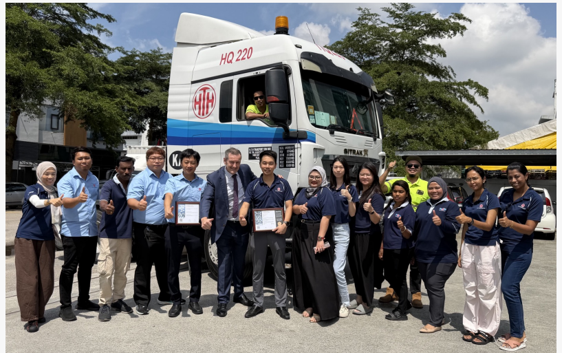
TAPA TSR HTH Certification Malaysia