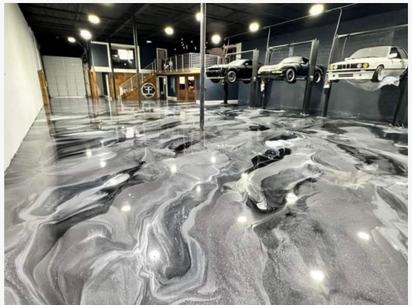
Commercial Epoxy Flooring Service