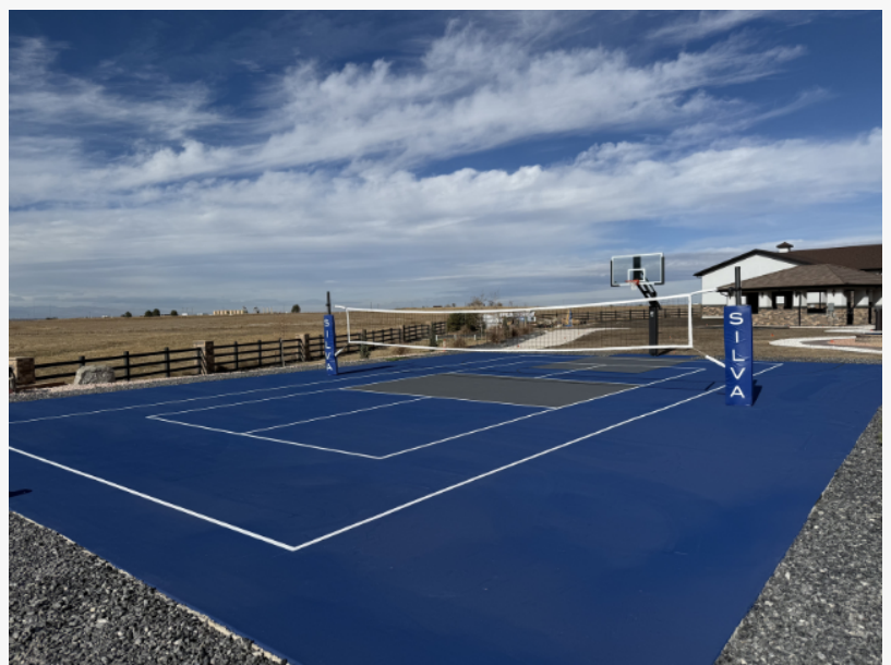
Sports Court Resurfacing Service, Denver

As athletic options continue to develop through schools and community organizations, facility safety standards remain a great operational concern.