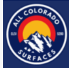
All Colorado Surfaces LLC - Denver, Colorado

Facility Managers Face Growing Maintenance Challenges