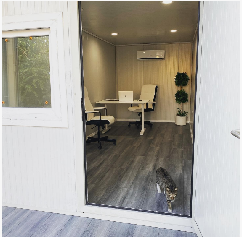
Modified shipping containers