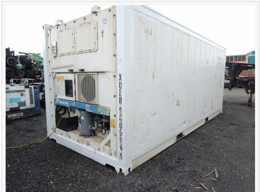
20ft refrigerated used shipping container

For many businesses, affordability is not only about the purchase price. It is also about reducing wasted time, improving organization, and keeping materials closer to the point of use. A container placed near a warehouse, yard, job site, shop, or loading area can make daily storage