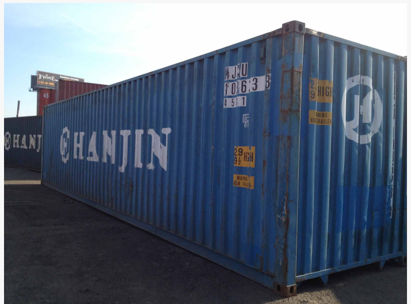
40ft HC Used Shipping Containers

Practical Storage for Businesses in Motion