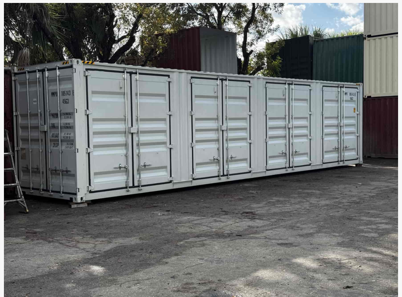
40ft HC One Tripper or New Open Side Shipping Containers